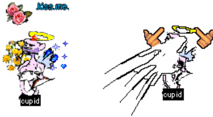
Picture 9. Cupid has received both loving and aggressive mementos.