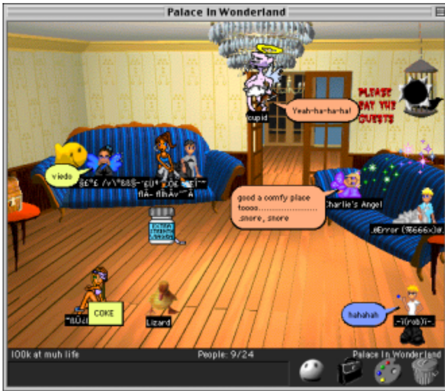
Picture 3. Set Dressing and gang avatars.