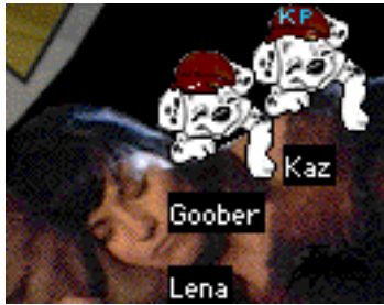
Picture 5. Sleeping tight

cuddle up with me. Somebody wearing animated dancing avatar may very well provoke the whole crowd to dancing mood.