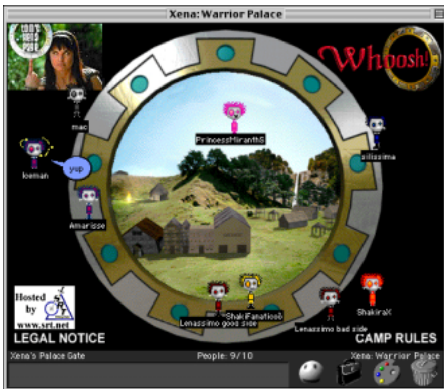
Picture 11. Korn Dolls

She is not talking just about avatars or identity but also about everything else in digital communication environments. Still, as a part of the means of communication and cultural vocabulary is an ability to represent one's identity. Design should offer tools to communicate it to others.